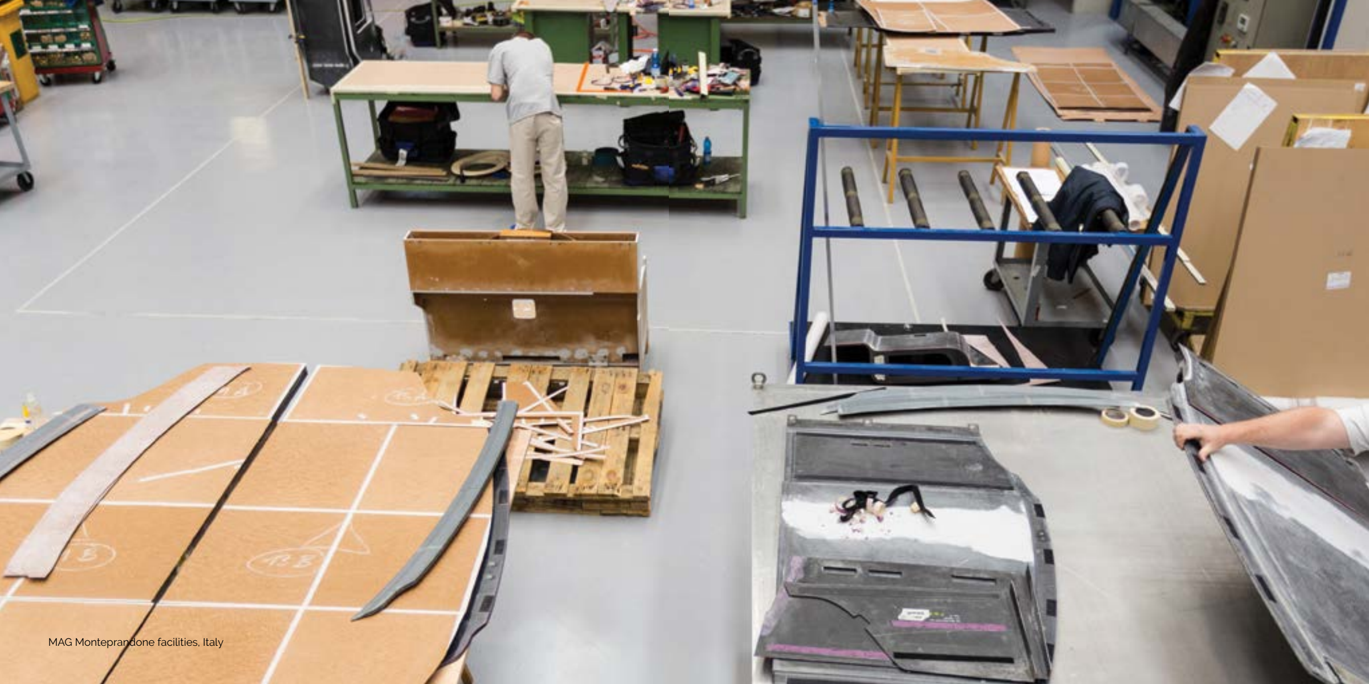
MAG Montepandone facilities, Italy