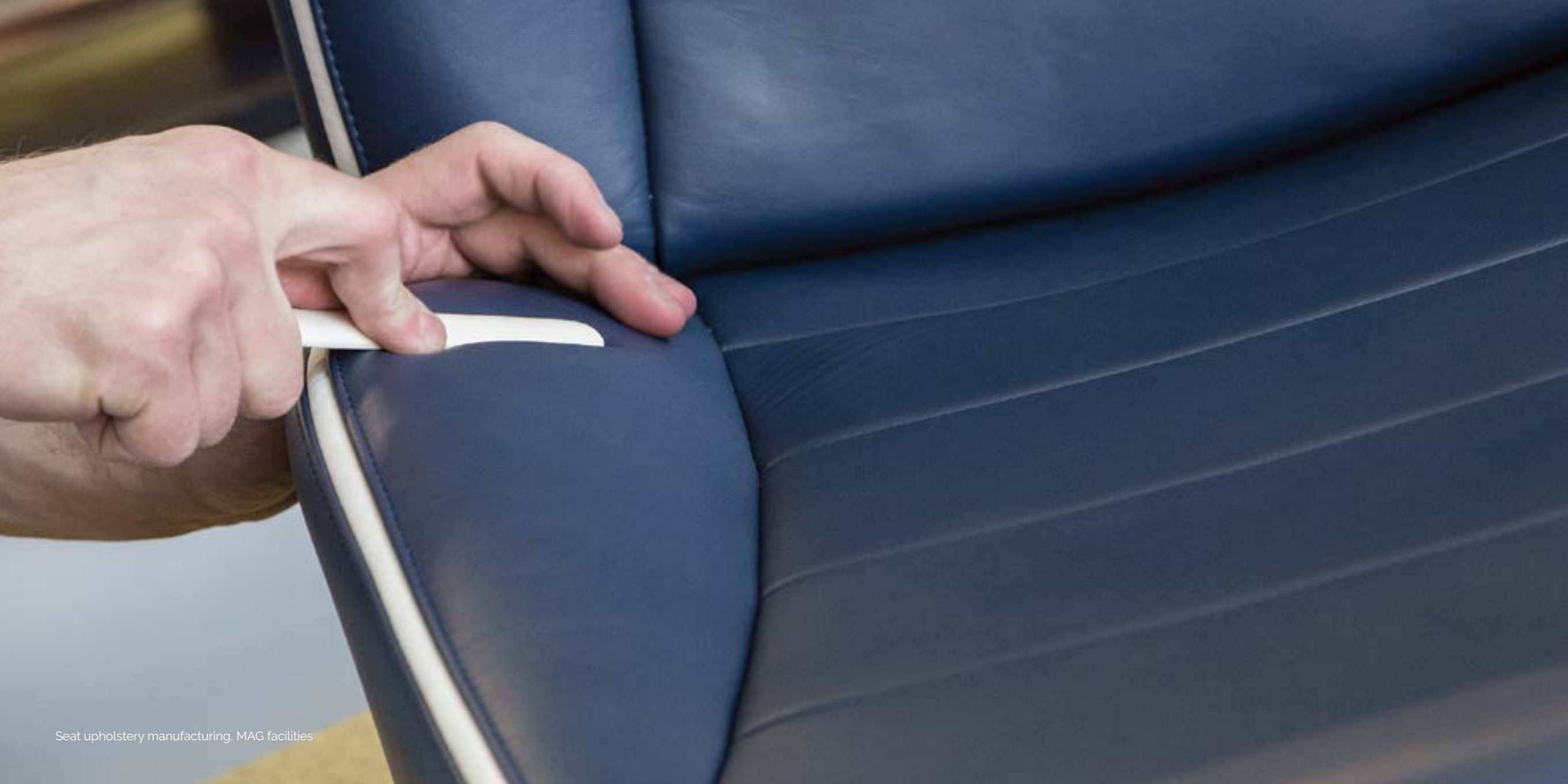
Seat upholstery manufacturing, MAG facilities