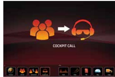
Passenger / Crew Communications

MAG's proprietary infotainment and cabin management system can be customized to any customer requirement and the most challenging environments. Full-cycle in-house design of the software, system architecture, functionality and graphic interface allow for simplistic and streamlined post-delivery support or any modifications. A few examples of the system's functions are shown below.