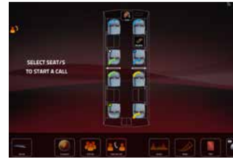
Seat to Seat Communications