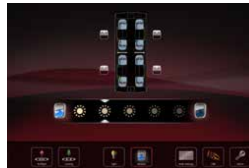
Independent Electrochromic Window Management