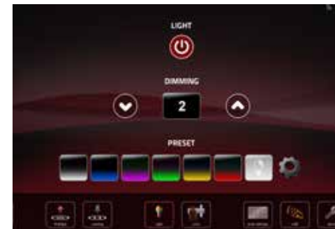
Ambient Light Control