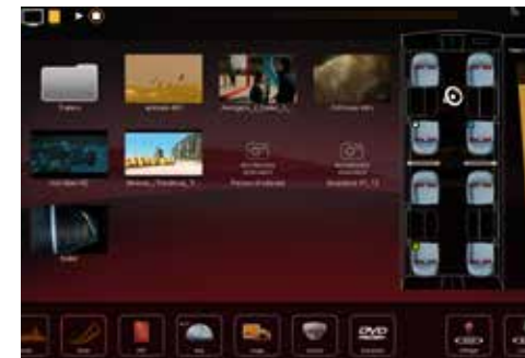
Audio - Video Entertainment