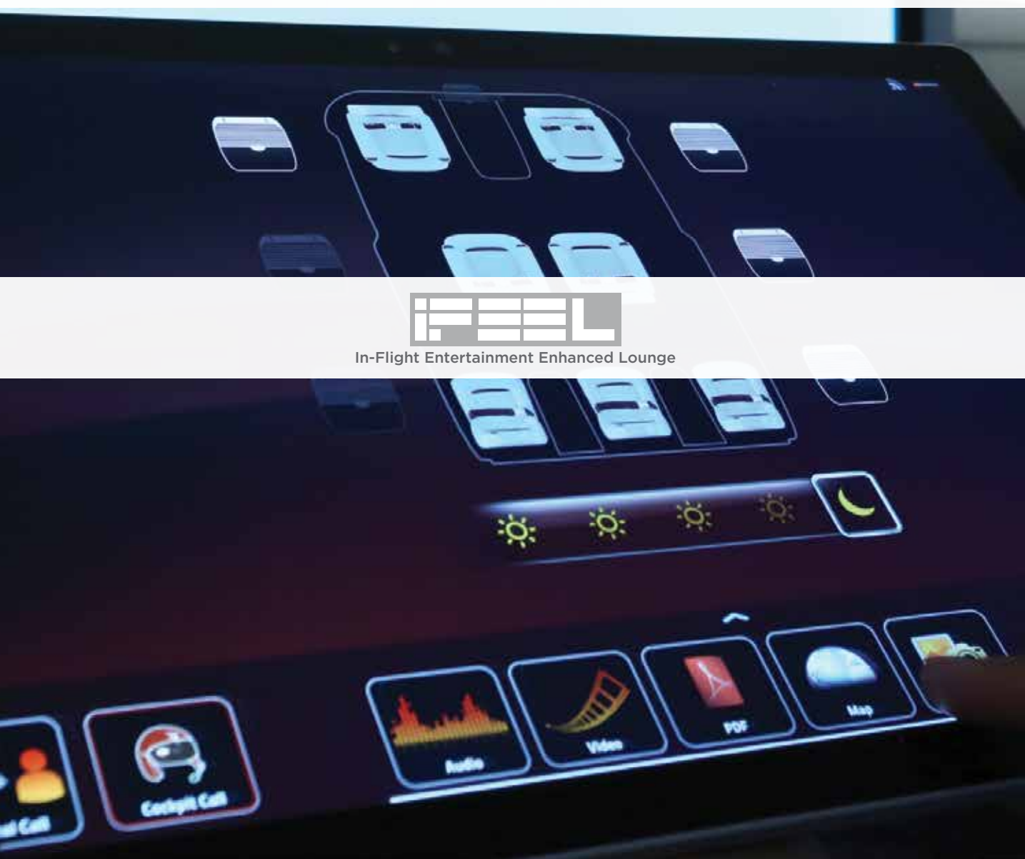
IFE In-Flight Entertainment Enhanced Lounge