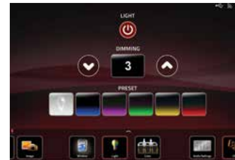
Ambient Light Control