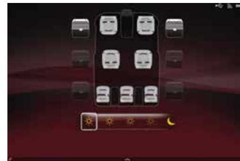
Independent Electrochromic Window Management