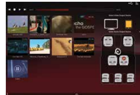
Audio - Video Entertainment