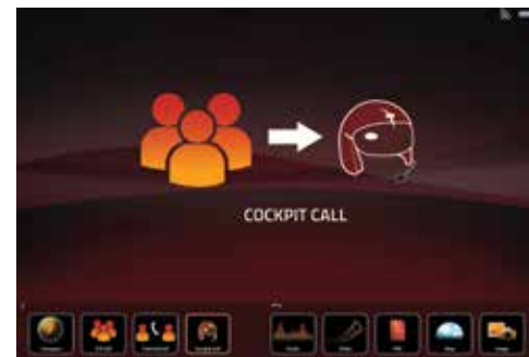
Passenger / Crew Communications

MAG's proprietary infotainment and cabin management system can be customized to any customer requirement and the most challenging environments. Full-cycle in-house design of the software, system architecture, functionality and graphic interface allow for simplistic and streamlined post-delivery support or any modifications. A few examples of the system's functions are shown below.