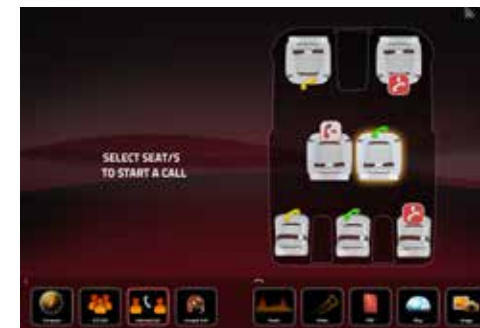
Seat to Seat Communications