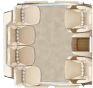
Layout - 3 (6 Passengers + 1 AFT Cabinet)