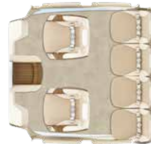
Layout - 5 (6 Passengers + FWD Cabinet)