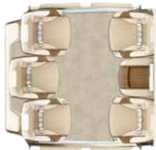
Layout - 1 (5 Passengers + 1 AFT Cabinet)