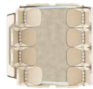
Layout - 6 (8 Passengers)