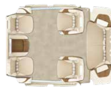
Layout - 4 (6 Passengers + 1 FWD Cabinet)