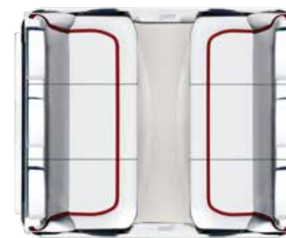
Layout - 4 (6 Passengers)