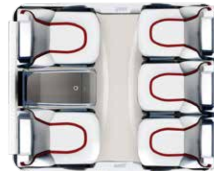
Layout - 3 (5 Passengers + 1 FWD Cabinet)