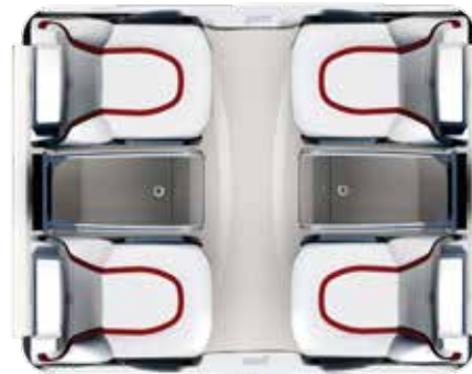
Layout - 1 (4 Passengers + 2 Cabinets)